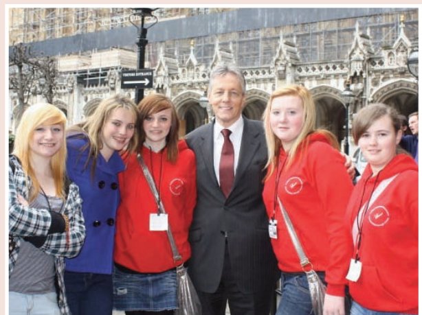
Young Women from Newtownabbey meeting First Minister Peter Robinson at the Houses of Parliament, Westminster.

The schools taking part on the programme were Ballyclare High School, Ballyclare Secondary School, Belfast High School and Newtownabbey Community High.